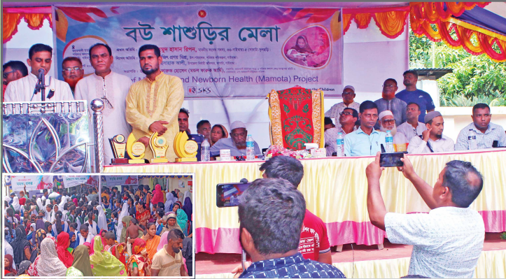
The Chief Guest is addressing during the Inaugural Session of the Fair in the presence of a huge gathering (Inset).

With support of SKS Foundation, the Management Committee of Union Health and Family Welfare Center (UHFWC), Bharatkhal, Saghata, Gaibandha, organized a fair titled Bou-Shashurir Mela (Daughter & Mother-in-law Fair) on 30 August 2023 at the Center. With around 500 people, 60 pregnant & lactating mothers labeled as daughters-in-law participated with their mothers-in-law in the day-long Fair. The Fair featured a range of programs including fun games, stall exhibitions, showcasing, debates, tree plantation, sapling distribution, etc. (See page 2)