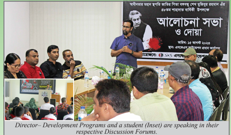
Director- Development Programs and a student (Inset) are speaking in their respective Discussion Forums.

With due respect and solemnity, SKS Foundation observed the National Mourning Day and 48th Martyrdom Anniversary of Bangabandhu Sheikh Mujibur Rahman. To mark the Day, SKS undertook various programs, including placing wreaths at his portrait, keeping the national flags half-mast, hoisting black flags at its offices, organizing discussion forums, and offering special prayers. On 15 August 2023, officials & staff of SKS Foundation and its sister concerns paid homage to Bangabandhu by placing wreaths at his portrait in Gaibandha Pouro Park, Gaibandha. Recalling Bangabandhu, and seeking eternal peace for departed souls, SKS organized a discussion forum and special prayer at its Head Office, Gaibandha. (See Page 3)