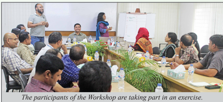
The participants of the Workshop are taking part in an exercise.

SKS Foundation in partnership with Concern Worldwide Bangladesh organized a Workshop on Safeguarding at SKS Head Office, Gaibandha on 19 September 2023. The senior-level staff of SKS participated in the day-long Workshop.