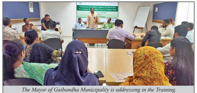
The Mayor of Gaibandha Municipality is addressing in the Training.

Leaders from CBOs and CSOs of Barisal City Corporation, Gaibandha Municipality & Saghata Union of Gaibandha, and Sreemangal Municipality of Moulvibazar attended a Training on Safely Managed Sanitation Services (SMSS) and City-wide Inclusive Sanitation (CWIS). To strengthen the capacity of the leaders on SMSS and CWIS, FANSA-BD members AVAS, SKS Foundation, WDP, and MAC Bangladesh organized the Training titled Training on Strengthening Capacity of CBOs/CSOs for Raising Their Unified Voices on SMSS/CWIS . The 2-day long training course was held at the respective area under the “Rising for Rights for Strengthening Civil Society Network in South Asia to Achieve SDG 6” project. The CBO & CSO leaders of the respective city/town including male & female councilors, officials of city corporation, municipalities, union parishad and the women leaders, sanitation workers, journalists, and development practitioners participated in the Training. (See Page 2)