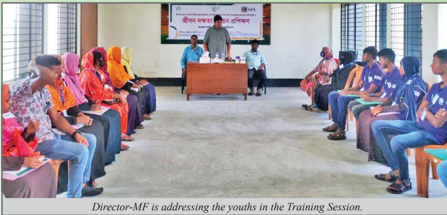
Director-MF is addressing the youths in the Training Session.

Employable youths from Rangpur, Dinajpur, Gaibandha and Bogura district received a 5-day long Life Skills Development Training organized by SKS Foundation. In 2 batches, the youths including 30 females & 20 males received the Training held from 23-27 July and 30 July to 3 August 2023 at the Conference Hall of SKS School & College, Gaibandha. Under SKS' 'Recovery and Advancement of Informal Sector Employment (RAISE) Project , the Training provided the youths with knowledge and information on customer dealings, behavior control, and orientation on how to run a business.